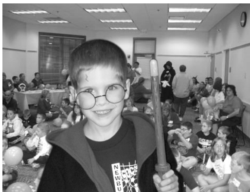
Lots of wannabe wizards turned out at midnight for the new Harry Potter book release party.