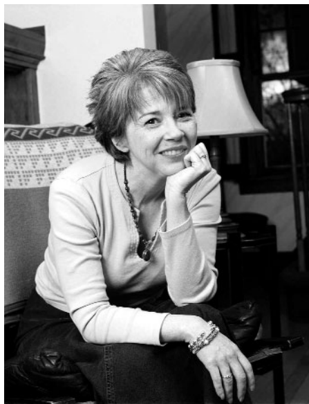
Dr. Mary Doria Russell

Dr. Russell will discuss this latest book as well as her first two award winning efforts.